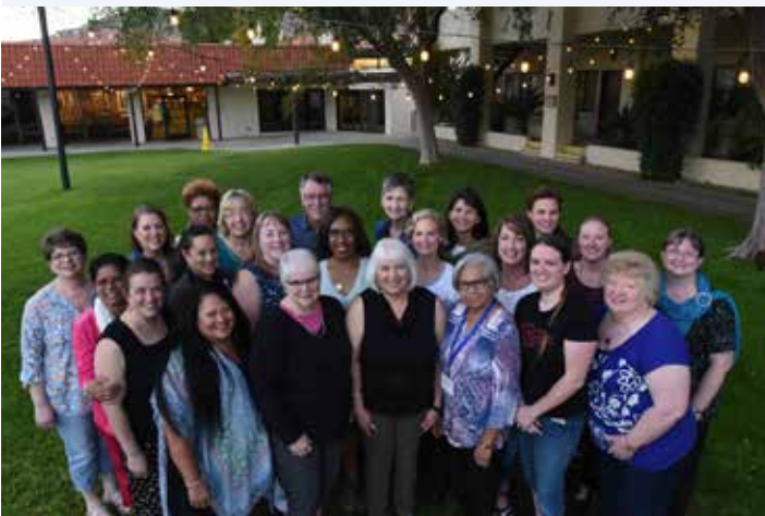
The executive board and advisors met in Phoenix, Oct. 18–20.

Working individually, in pairs, then in small groups and as the whole board, the board members continued strategic planning work begun in April, answering two questions: What are the most critical areas of concern for the organization and what would you like to see the churchwide women's organization achieve. Both questions drew answers centering on financial sustainability, reaching more women, developing leaders and increasing communication. A visioning exercise—