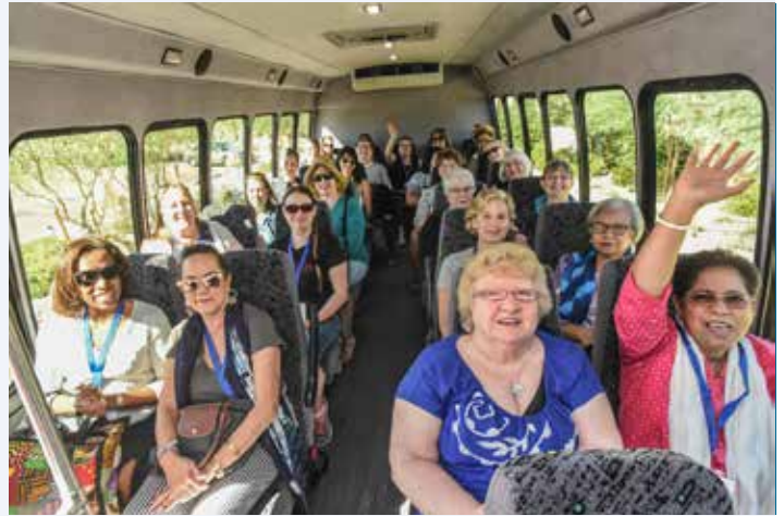
The executive board tours triennial convention and gathering sites in Phoenix, Ariz.

On the request of the programs and communication