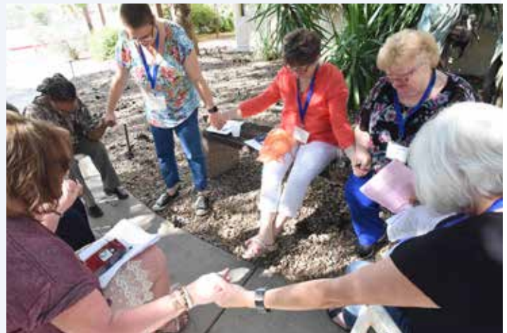
Staff and board members pray before a planning meeting.