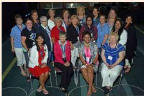
New board members

In business sessions, the voting members of the Tenth Triennial Convention of Women of the ELCA: