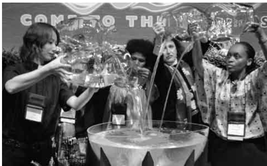
Chaplains and international guests fill the font.

After the excitement of coming together with friends old and new, seeing who's here and hearing their news, and praising God in word and song, the participants streamed out of the convention center to hear one of the most famous singing groups in the world: the Mormon Tabernacle Choir in its open rehearsal for its national radio program. ~~~