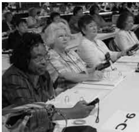
Delegates using voting machines

Triennium," she said. Highlighting some of the accomplishments, she mentioned the inauguration of Bold Women's Day in 2007 and participation in women's health issues through the Raising Up Healthy Women and Girls initiative, endorsement of the HEART for Women Act, and articles in Lutheran Woman Today . Women of the ELCA