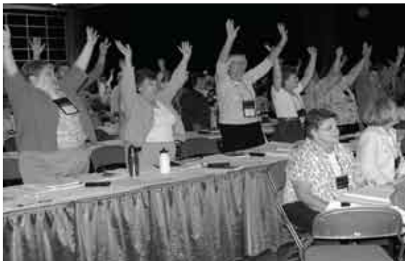
Delegates stretch during breaks.

Minimizing or eliminating use of plastics: "Making bottles to meet Americans' demand for bottled water requires more than 1.5 million barrels of oil annually, enough to fuel some 100,000 cars for a year," the memorial states. Delegates encouraged women to look for ways to eliminate unnecessary use of plastics at events, within the congregations, and in homes and to raise awareness about bottled water issues.