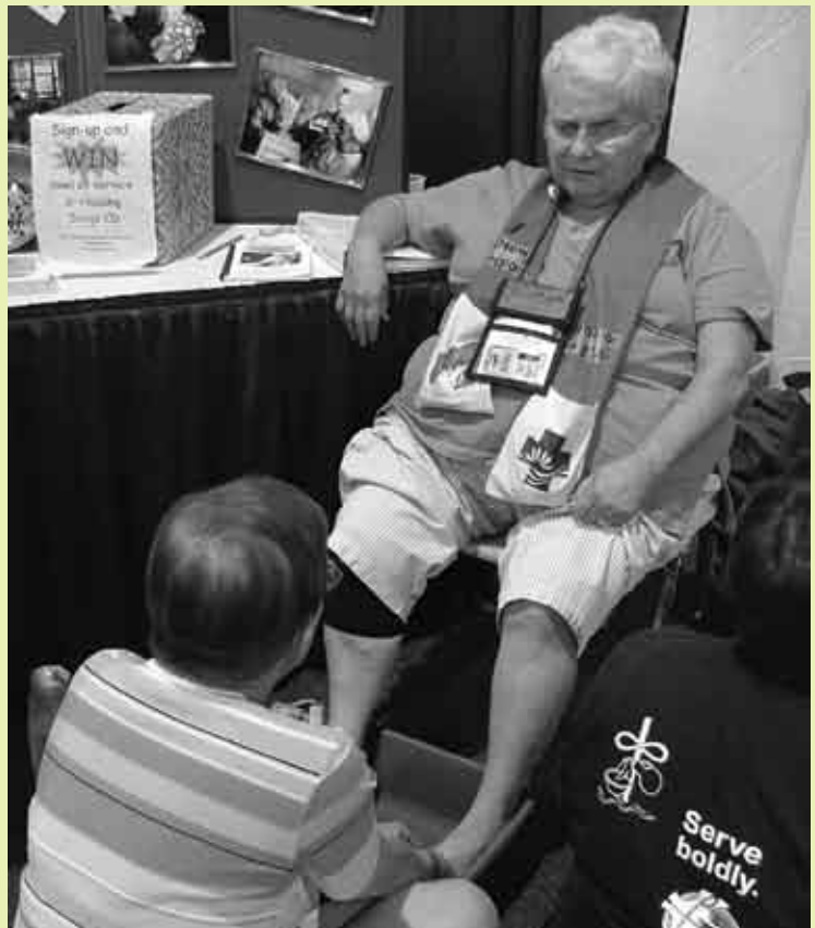
At the Deaconesses booth, tired feet get washed.

Have you been to Gather at the River in Hall C? That's where the action is! Don't miss the Women of the ELCA display area. There you will find plenty of free items—note pads, coasters, brochures, and more. Learn about resources and take home ideas and tools for use in your congregation.