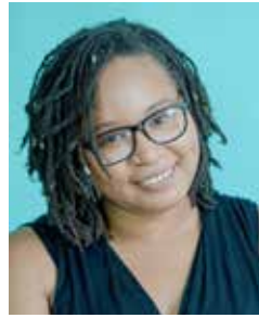
Sharei Green Chicago, IL Region 5, Metropolitan Chicago SWO